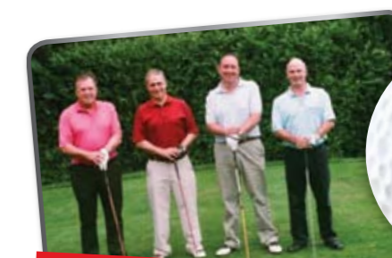
The winning team from Apres Bar UK